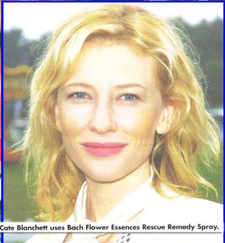
To de-stress, Cate Blanchett uses Bach Flower Essences Rescue Remedy Spray.